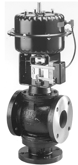
V-9502 Positioner Installed on a Rubber Diaphragm Type Valve Actuator

The starting point is the input pressure (Pilot P pressure) at which the actuator just begins to stroke. The starting point is field adjustable from 2 to 12 psig (14 to 83 kPa) using the starting point adjusting screw located under the V-9502 Positioner cover. Turning the screw clockwise decreases the starting point, and turning the screw counterclockwise increases the starting point.