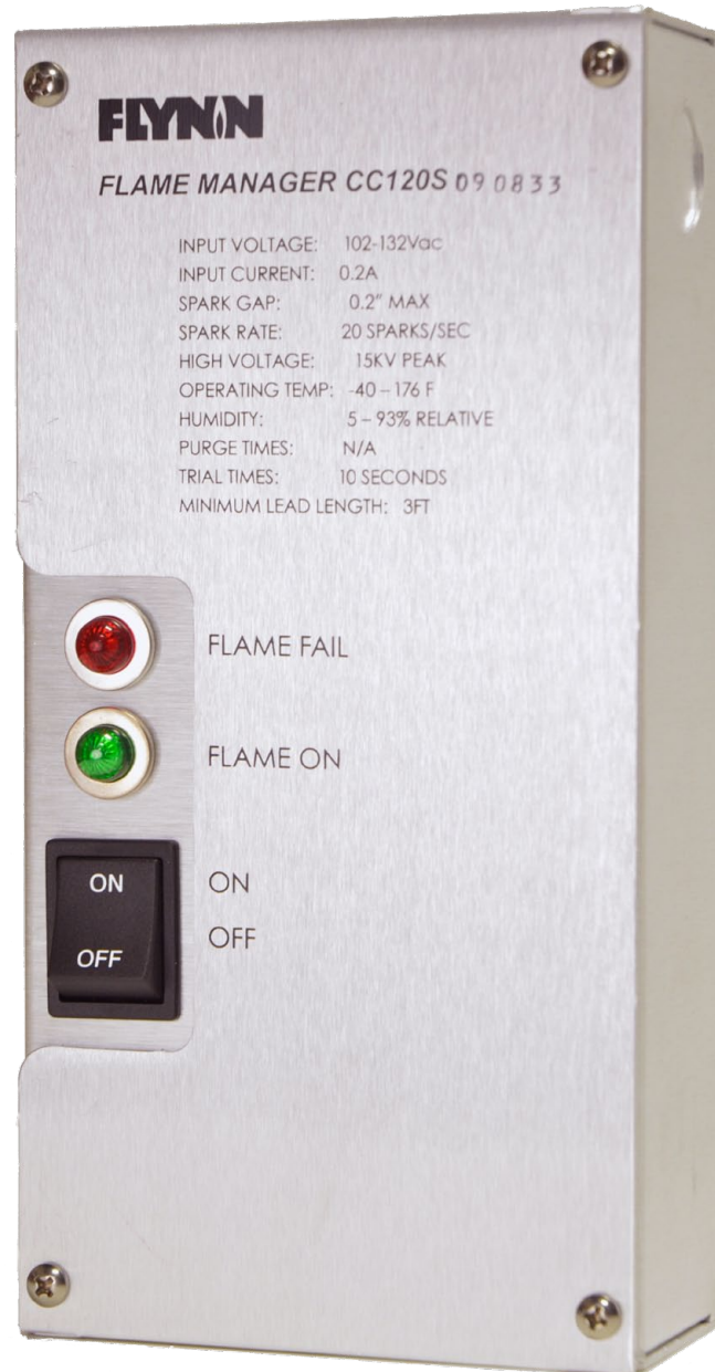
Part No. 090833 Shown